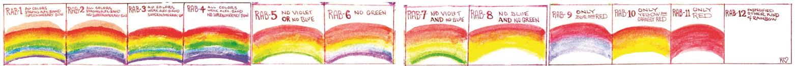
If KCPC were a rainbow... what type of rainbow would KCPC be?